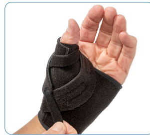
Bring the strap around the base of your thumb and attach the tab