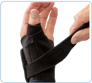
Stretch the strap lightly and bring the strap around the base of your thumb