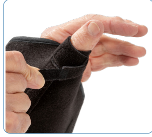
Close the thumb strap with light tension