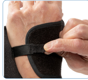
Hold the flap in place as you grasp and attach the Easy-On Tab