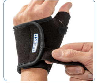
Grasp the strap or the edge of the flap and pull the brace closed