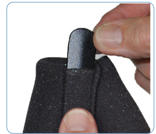
The bendable plastic stay can be removed from the interior pocket as needed