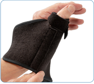
Slide thumb into the brace