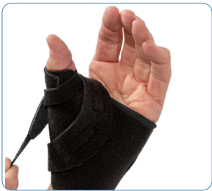
Continue lightly stretching the strap around your thumb and over your web space