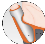
Lightweight aluminum contours for custom fit