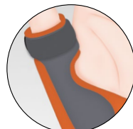
Adjustable thumb strap for optimal comfort