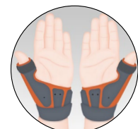
Fits right/left hand