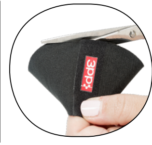
Slip the Cozy on with the 3pp label on the back side of the thumb. Apply the brace. The Cozy can be trimmed with a scissors as needed.