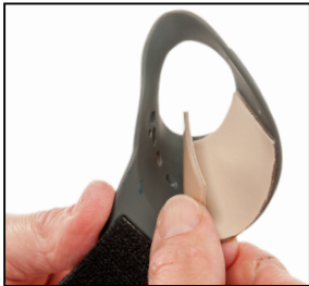
Position the pad in the brace. Do not cover the strap hole. Adjust as needed so the gel does not overlap the edges.