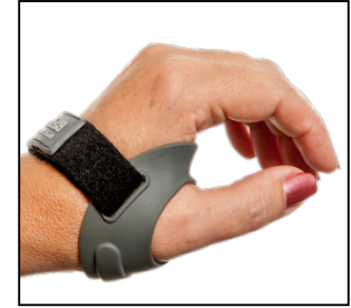
Pinch your index and thumb together. Fit should be snug but not tight.