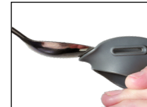
Use the back of a spoon to gently roll the heated edge. Allow to cool 30 to 60 seconds.

Care instructions: Remove strap from brace and hand wash with mild soap and water. Lay flat to dry. Wash brace with mild soap and water, towel dry. May be machine washed in a delicates bag. Air dry. Do not place in the dryer.