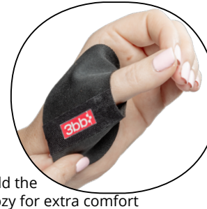
Add the Cozy for extra comfort