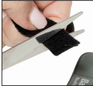
Cut the strap and re-apply the tab.