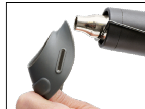
Use a spot heater to heat the edge of the brace until shiny and the material gives when pushed. DO NOT OVERHEAT

This step should be done by a healthcare professional trained in fitting braces