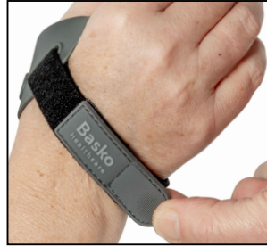
The closure tab should be centered on the back of the hand.