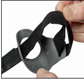
Pull the strap 1 to 2 inches to shorten it and fasten the velcro.