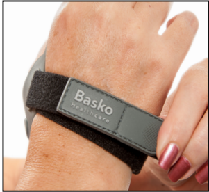
Locate where to cut the strap so the tab will be centered on the hand.

Once the brace has been fit, the strap can be cut if needed so the tab is centered on your hand.