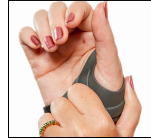
With the brace on, squeeze the stay to form it around your thumb.