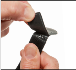
Open the closure tab and remove it from the strap.