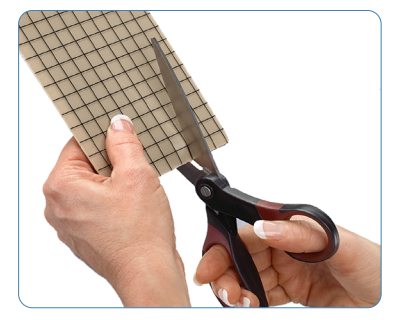
Grid backing makes it easy to cut Gel Mate to size and can be used to document healing and reduction in scar size.